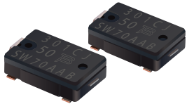
Bourns® SW Series Mini-breakers