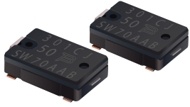
Bourns® SW Series Mini-breakers