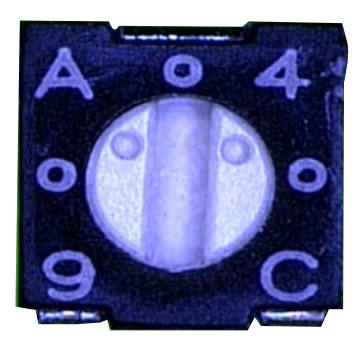
New Halogen Free Model