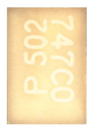
Current Material Compared to the Bromine-Free Material