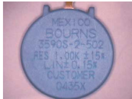
Laser print marking method

Please note that this change does not affect form, fit or function of the product. There will be no changes to current prices, minimum order quantities or multiples.