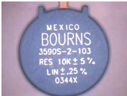
Ink print marking method

In line with our commitment to product excellence, Sensors & Controls is introducing a product marking improvement to all catalog models currently marked for identification with ink. The product upgrade utilizes laser-marking technology in place of marking ink. This change will improve piece part processing and provide end customers with a more durable marking. The photos below show the difference in marking.