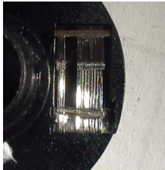
Old Contact Spring Design

The newly designed contact spring is a more robust and durable design. This contact spring upgrade does not affect fit, form or function of the product.