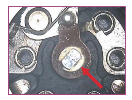
Old design with c-clip

As detailed in the photos below, the design upgrade eliminates the use of a c-clip to affix the switch actuator to the shaft. The new design incorporates the use of a riveting process to firmly secure the switch actuator to the shaft.