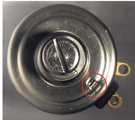
New cover design

Please note that this change does not affect form, fit or function of the product. Product will begin shipping with this improvement beginning with date code 0627X. There will be no changes to current prices, minimum order quantities or multiples for this improvement.