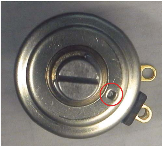
Old cover design

In line with our commitment to product excellence, Sensors & Controls Division is introducing a product design improvement to our popular 3540 , 3541 , 3543 and 3545 models. The design improvement entails a change to the cover/strap that is used to adhere the bushing to the housing. The cover serves a secondary purpose in keeping the bushing from rotating when the unit is installed on a panel. The design of the tab that locks the bushing in place has been improved to provide a more robust lock. The photos below show the change in design.