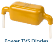
Power TVS Diodes