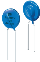
IsoMOV™ / GMOV™ Hybrid Protection Components