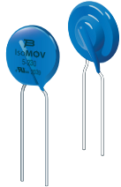
IsoMOV™ / GMOV™ Hybrid Protection Components