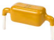
Power TVS Diodes