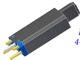
F-Series GDT 5-Pin 4-Type/Sneak Current

The F Series 5-Pin SuperDuty® GDT Overcurrent Surge Protectors feature high surge-energy handling.