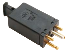
F-Series SS 5-Pin 3-Type/Overvoltage

All models have industry standard footprints and are UL Listed.