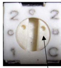
New Rotor Color - Natural

There is no change to form, fit or function of Model 3313. The alternate material to be used in the Bourns® Model 3313 rotor is the standard rotor material used in the Bourns® Model 3314.