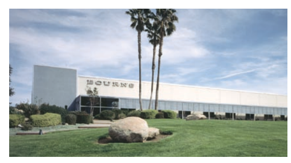
Bourns, Inc. Riverside, California U.S. Headquarters