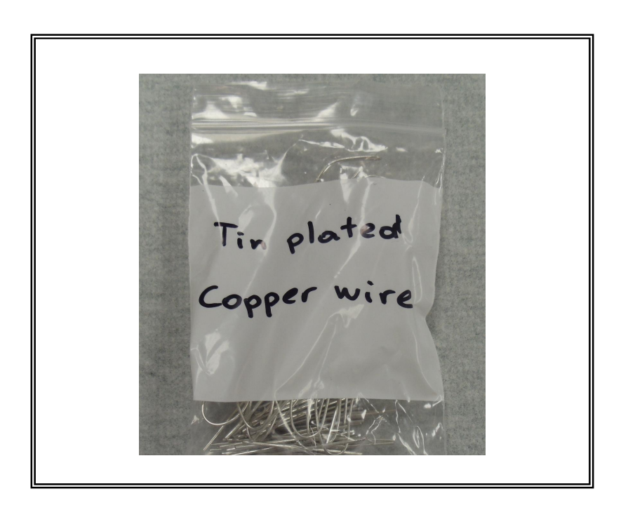
SGS authenticates the photo on the original report only