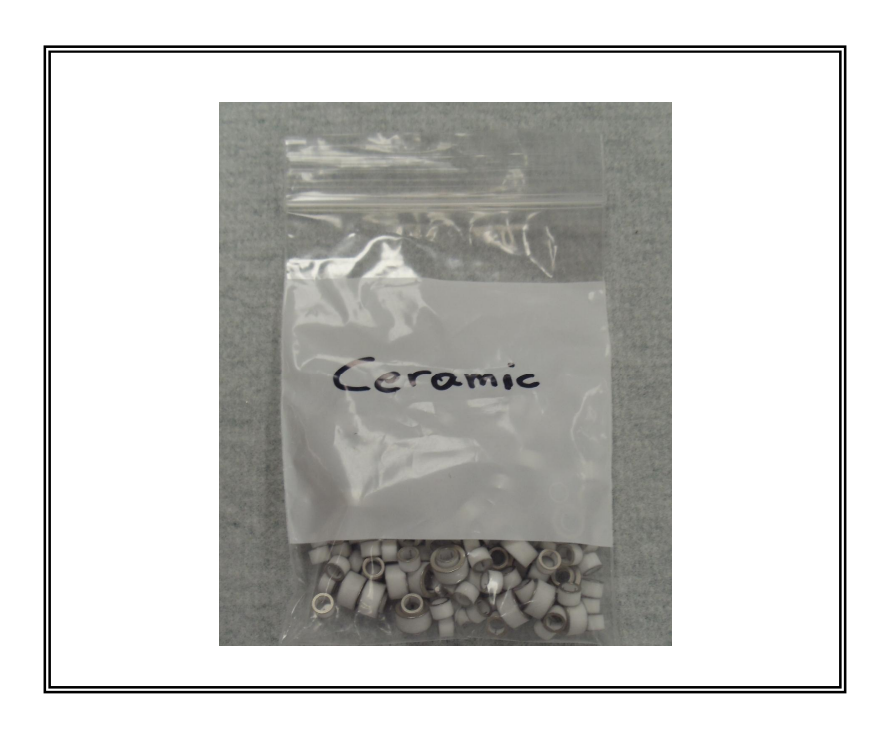
SGS authenticates the photo on the original report only