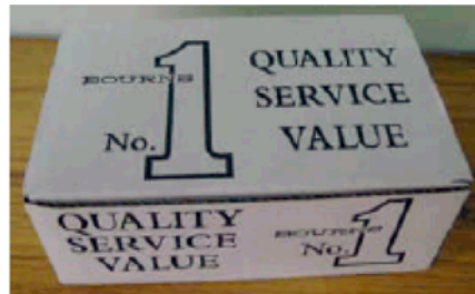
Product Packaging - After

This change is effective October 17, 2010.