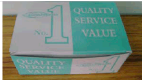
Product Packaging - Before

The following photographs illustrate the changes.